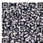
Registrar Pharmacy Council